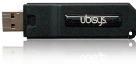
RFID USB Stick

IP licensing for high-volume, high-density integration possible (with embedded interface options including UART, SPI, and I 2 C)