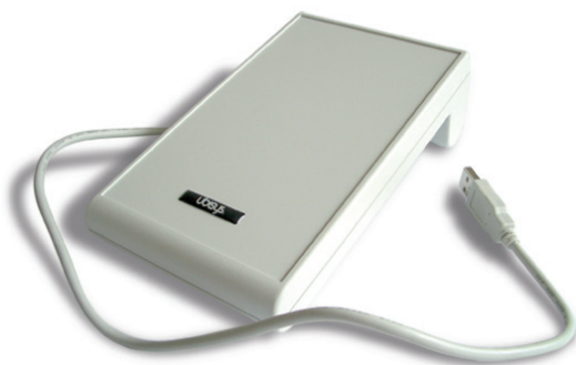
RFID USB Desktop-Reader